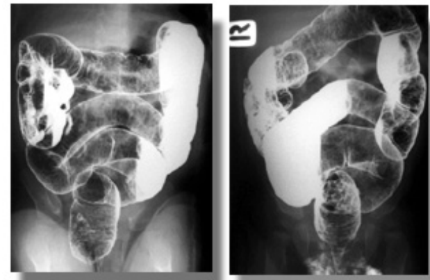
Figure 1: Barium enema shows findings consistent with lymphonodular hyperplasia.